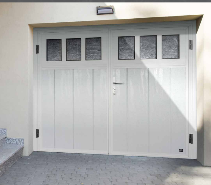
Vertical layout, mid-rib woodgrain panels, obscure front glass, 'BS' glazing.