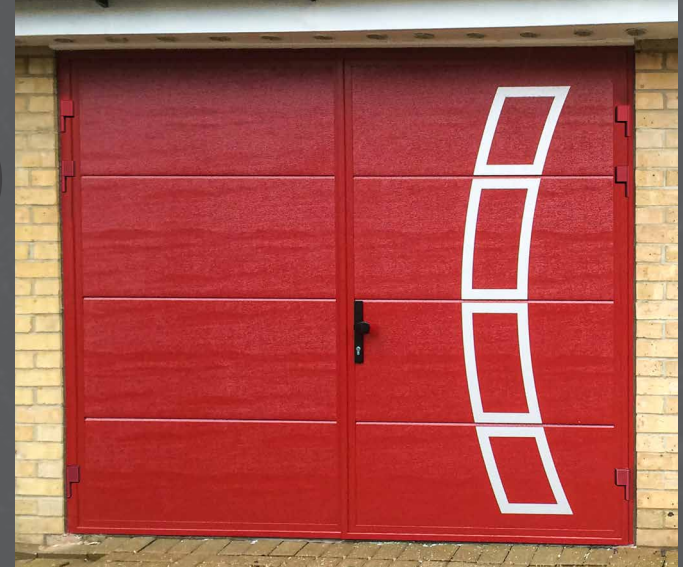
'Traffic Red' finish with 'Sails' design stainless metal decals

The bright yellow will change your mood whatever how upset you are. The doors feature rectangular pull-handles and oblong stainless steel windows.