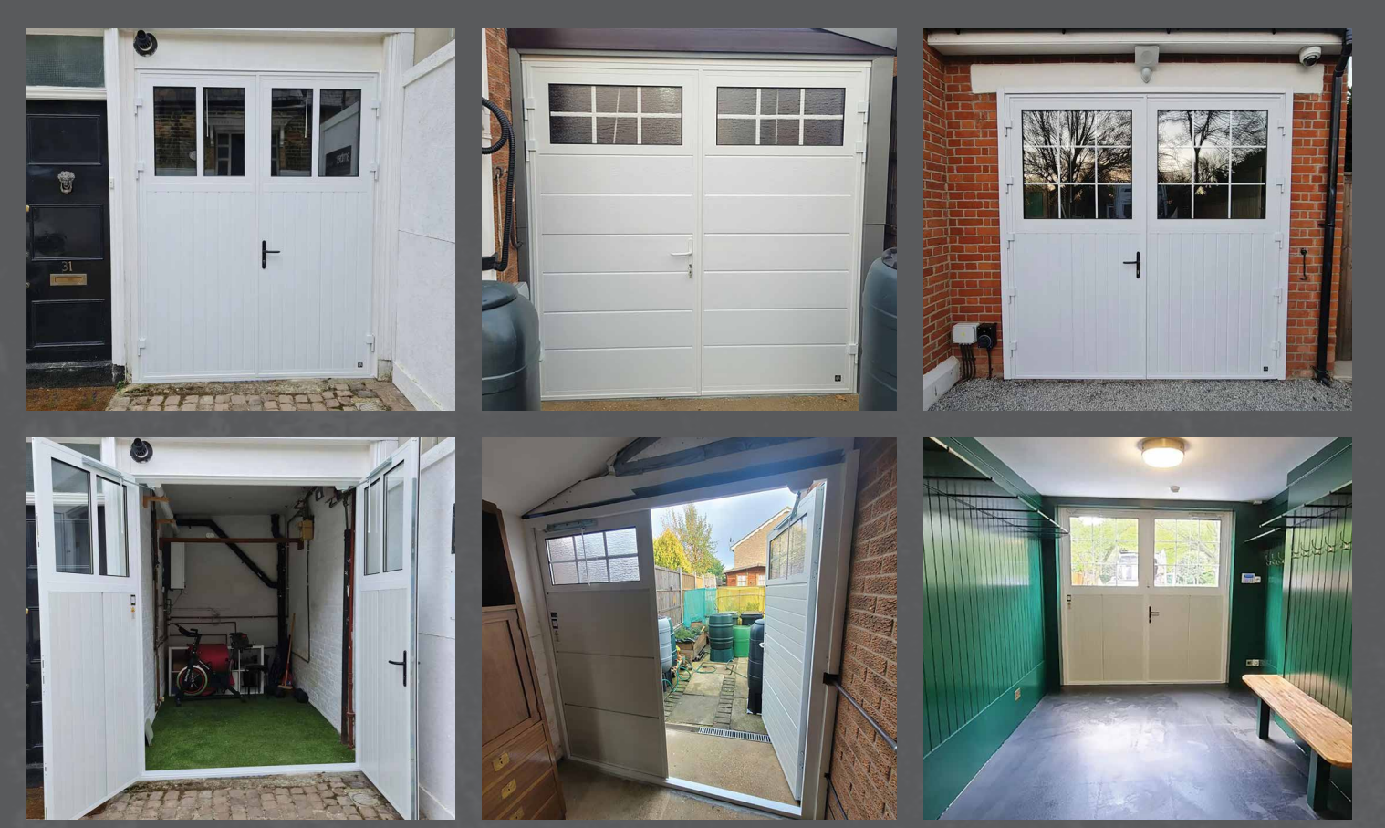
Traditional design doors are a very popular option when refurbishing a garage. Many garages are now under conversion to be used as utility rooms, extra storage, gyms, or hobby spaces.