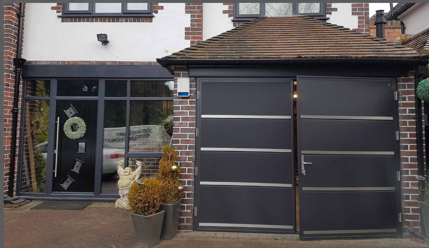
Horizontal narrow stainless metal decals highlights the elegance of the door design.

Stainless steel decals, handles and windows can create vibrant look of your door. Using one or a combination of elements you can create elegant kerb appeal. All elements can be powder coated to a colour of your choice to create subtle or dramatic design contrasts.