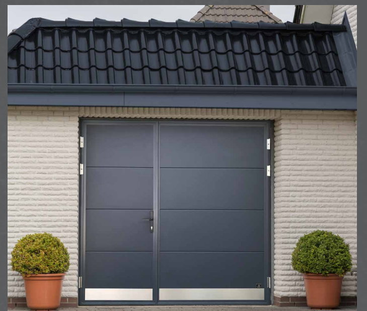
Smooth surface 'Anthracite Grey' finish perfectly contrasts with stainless steel kick plate.

\label{eq:constraint} Entrance \ and \ garage \ doors \ made \ in \ matching \ design. \ 500 mm \ pull-handle, \ 'Mid-rib' \ design.