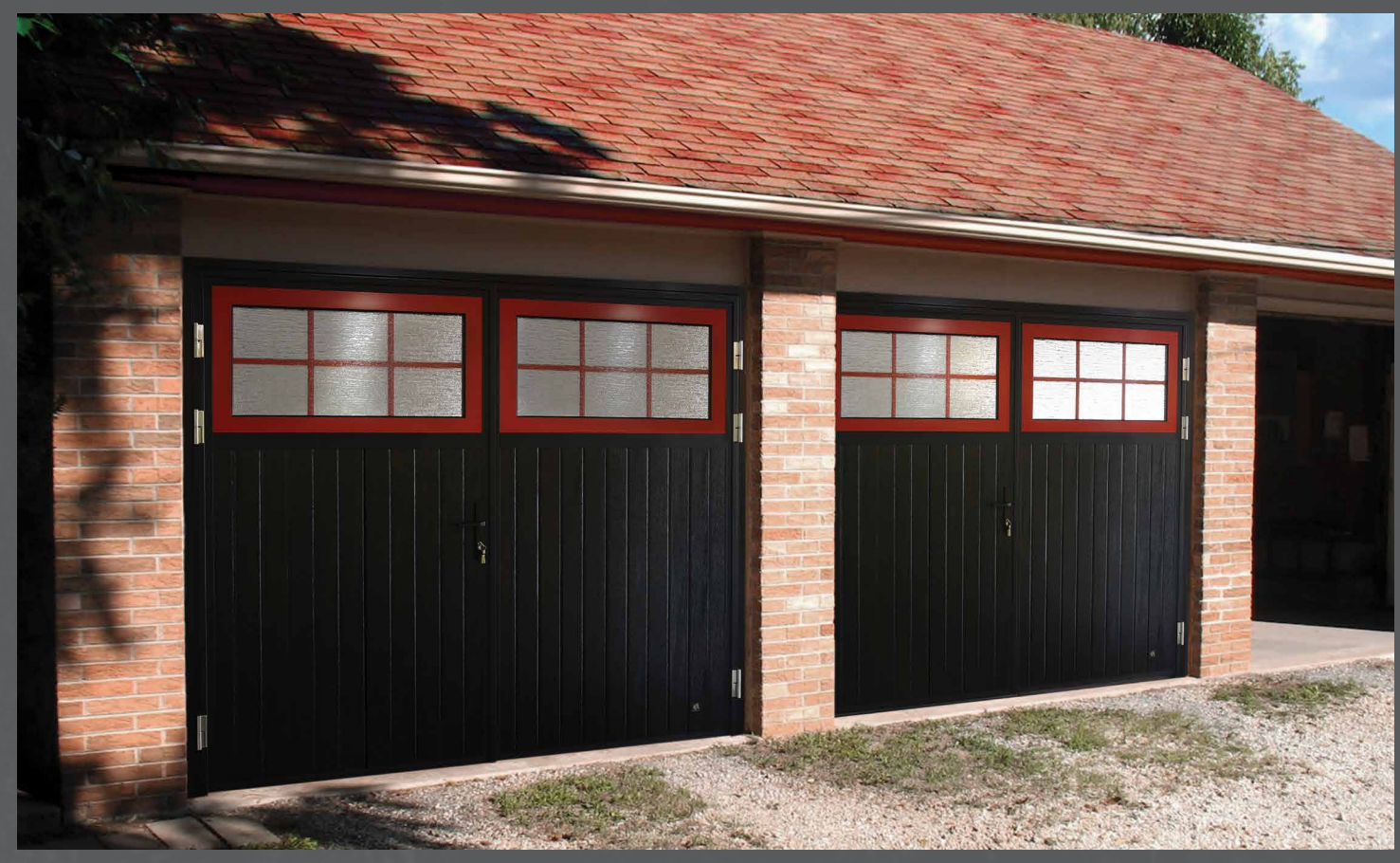
Glazing panels in contrasting 'Flame red' colour.

A classic design door. Replace the door but not the style! Double glazed panel with clear, matt, obscure or tinted glass. An internal cross décor can be added. Any RAL or BS colour including wood image colours.