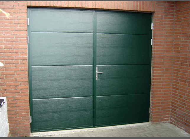
'Moss Green' matches with a masonry colour.