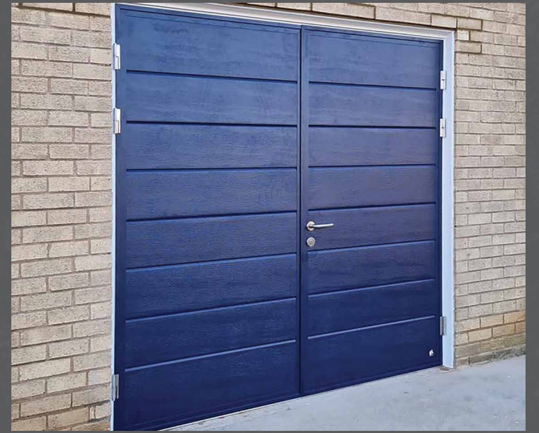
Humble door in 'Sapphire Blue' finish with stainless steel lever handle.