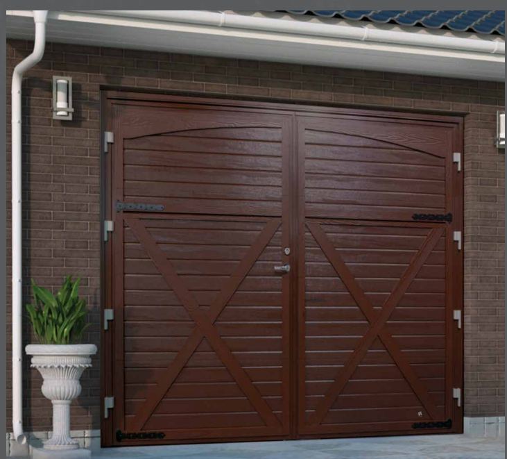
Composite fiber-cement planks allow to create image resembling carriage-house or stables door image.