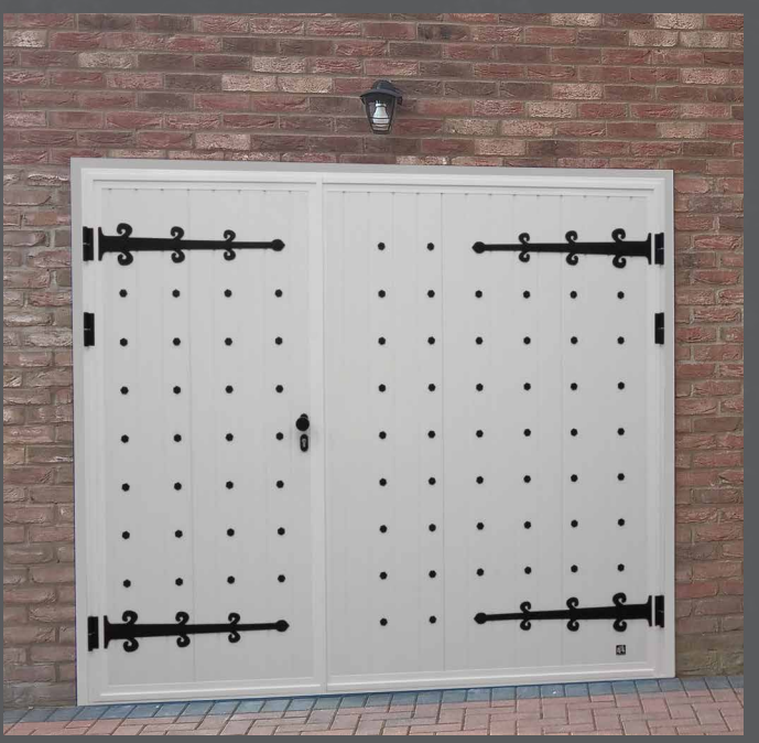
'Castle' design. Wrought iron accessories turns modern door into armoured caste door.

Hinges and pull-handles made to look as wrought iron create a hand-made old fashion barn door.