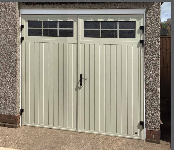
'Pebble Grey' colour, vertical layout, rib woodgrain panels, obscure front glass, 'cross' glazing.