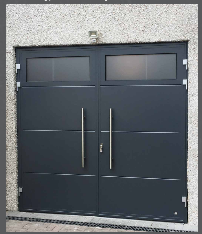
'Anthracite grey' colour, horizontal layout, slick smooth panels, matt continuous glazing.