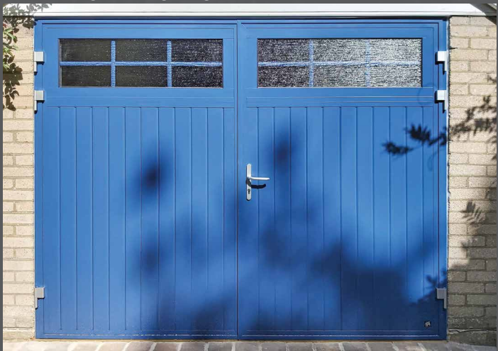
'Sky blue' colour, vertical layout, rib woodgrain panels, obscure front glass, 'cross' glazing.