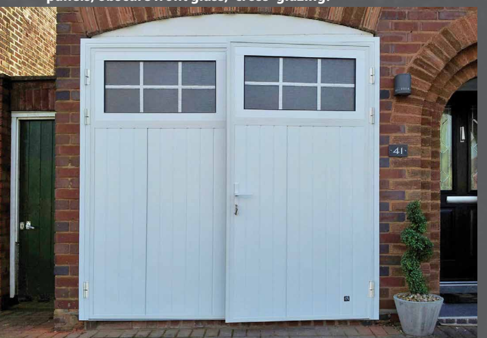
Vertical layout, rib woodgrain panels, obscure front glass, 'cross' glazing.