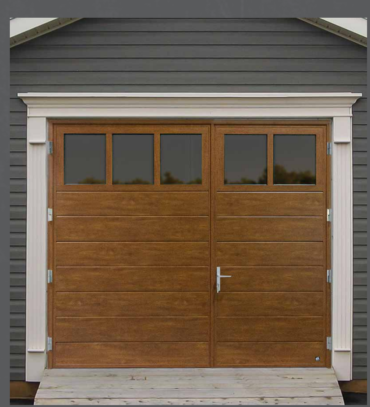
'Golden Oak' finish, horizontal layout, 'BS' tinted glazing, 60/40 split.