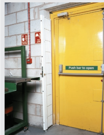
Folds away to leave opening clear