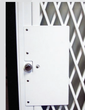
Innovative thumb-turn lock